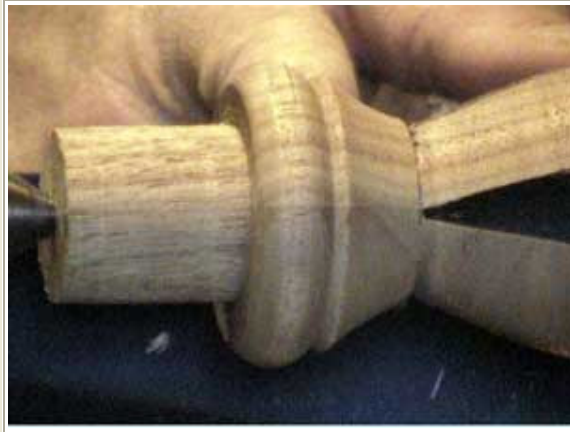
The spigot and end turned, ready for sanding

This involves turning an oval shape between two square spigots. The timber is then carefully quartered lengthways. The parts are turned and rejoined so that there is a hollow in the middle. The outside is then turned and the ends made round.