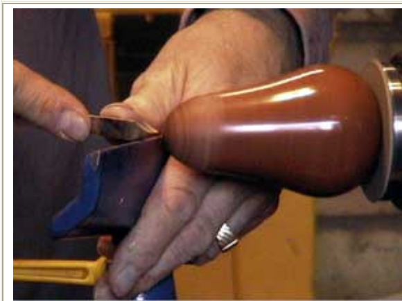
Just look at that finish!